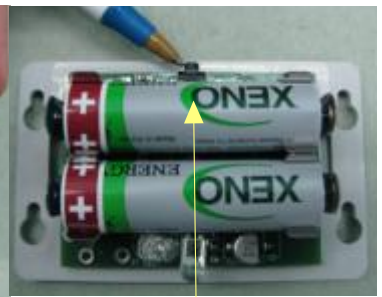
Transmitter Unit Push-Button